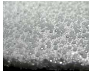
Material before heating