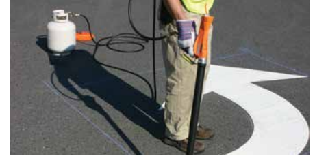
Step 3: Heat