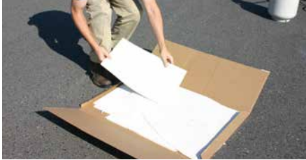
Step 1: Prepare