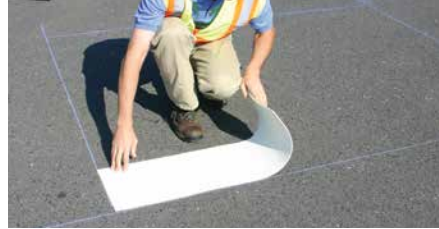
Step 2: Position