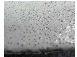
Material after heating with ideal 60% glass bead embedment for optimal performance