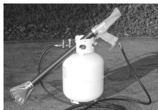
Flint 2000EX Propane Heat Torch (cylinder not included)