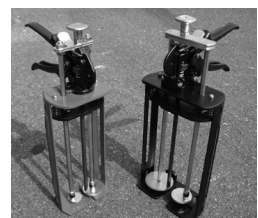
TopMark® Sealer and Dispensing Guns

*All prices are FOB Thomasville, NC. Subject to change without notice.